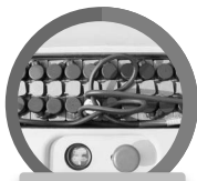
Lead acid battery